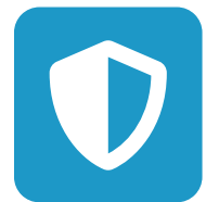
LobiCom Central Security